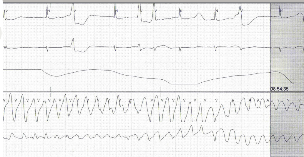
Figure 1. Torsades de pointes

The initial electrocardiogram (ECG) showed sinus bradycardia, PR interval of 200 ms, prolonged QTc interval (640 ms, Bazett's formula) and T-wave inversions in lateral and anterior leads (figure 2). Her ECG from one year ago showed a normal QTc interval. Blood tests revealed hypokalaemia of 2.7 mmol/L, normal magnesium (0.82 mmol/L) and adjusted calcium levels (2.53 mmol/L). Potassium levels normalised within a few hours after potassium infusion. Her thyroid function tests showed severe hypothyroidism with high thyroid stimulating hormone (>150 mIU/L, normal range