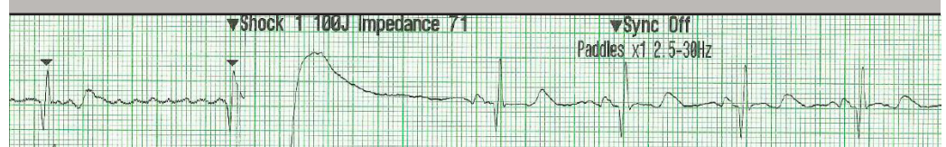
Figure 1. ECG showing atrial fibrillation and sinus rhythm being restored after direct current cardioversion

Direct current (DC) cardioversion (DCCV) is one strategy to restore sinus rhythm in patients with AF (see figure 1), and has been used in clinical practice since the 1960s. This procedure has relatively high initial success rates, however, it has become increasingly evident that the procedure has a high failure rate in the longer term. Previous studies have shown that between 20% and 47% of patients remain in sinus rhythm at one year. 4,5 Accordingly, recent guidelines recommended that anticoagulation