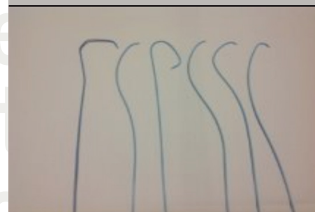
Figure 2. Standard 5.2 French diagnostic catheters used during native coronary and graft angiography. From left to right: TIG, Judkins right 4.0 (modified) catheter, Judkins left 4.0 catheter, right coronary bypass catheter, left bypass catheter and internal mammary (IM)

( figure 1D ). The SVG to PDA was patent with a good run off. The catheter was disengaged for a final time before being withdrawn slowly into the subclavian artery where the LIMA graft was successfully engaged to show a widely patent graft with a severe lesion just beyond the anastomosis site ( figure 1E ). The guidewire was re-inserted to remove the TIG catheter over the wire. Haemostasis was achieved using a TR band (Terumo Medical Corporation).